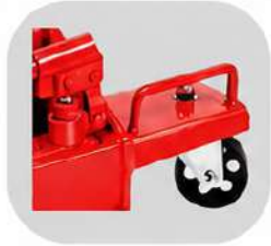
Four handles for easy repositioning