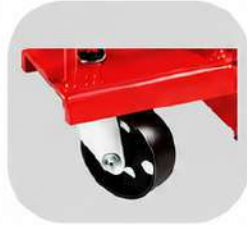
360° swivel casters for versatility