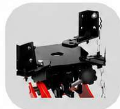
2 pcs safety chains