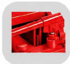
360° rotating handle & pump the handle to raise the jack