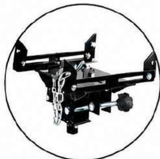
ACCESSORIES TRANSMISSION ADAPTER